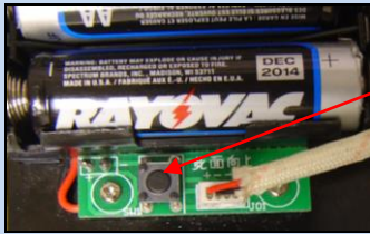
Reset button on E5 locks